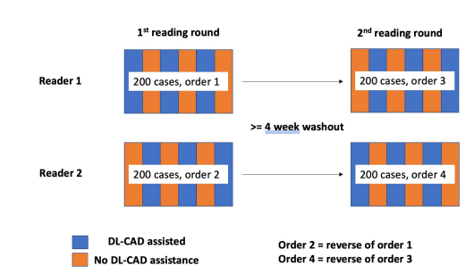
Figure 3: Multireader multi-case design